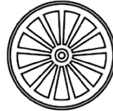
RI Badge 1906

The solid band in blue and gold, which supports the teeth, gives the strength